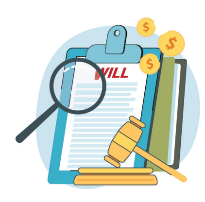
Research and consider these documents to include in your estate plan: